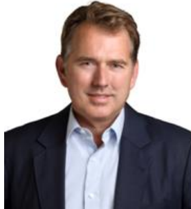
Clem Newton-Brown Liberal Party (Incumbent)